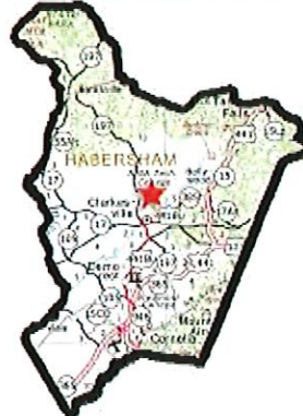
Exhibit D Aerial Map